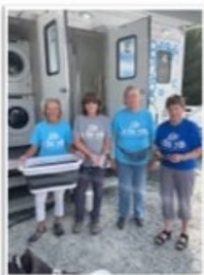
PW members volunteer at the 1in7B Foundation in Newark

For more information or to volunteer go to 1in7BFoundation.org